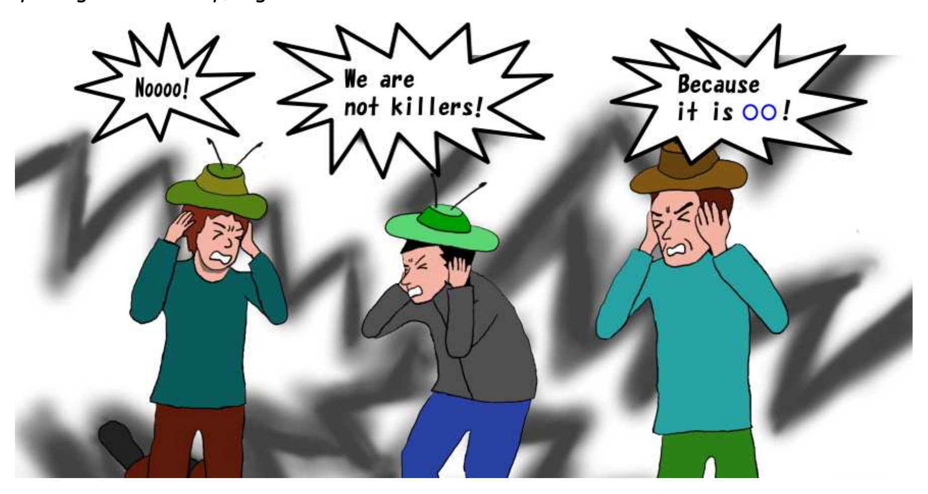
Within \bigcirc\bigcirc , the imagination made by them enters.

When the real world is too hard, one may escape from the reality. It is not necessarily limited to an individual case. There are cases where people cooperate to make up imagination and take it as a reality and deny the genuine reality, together.