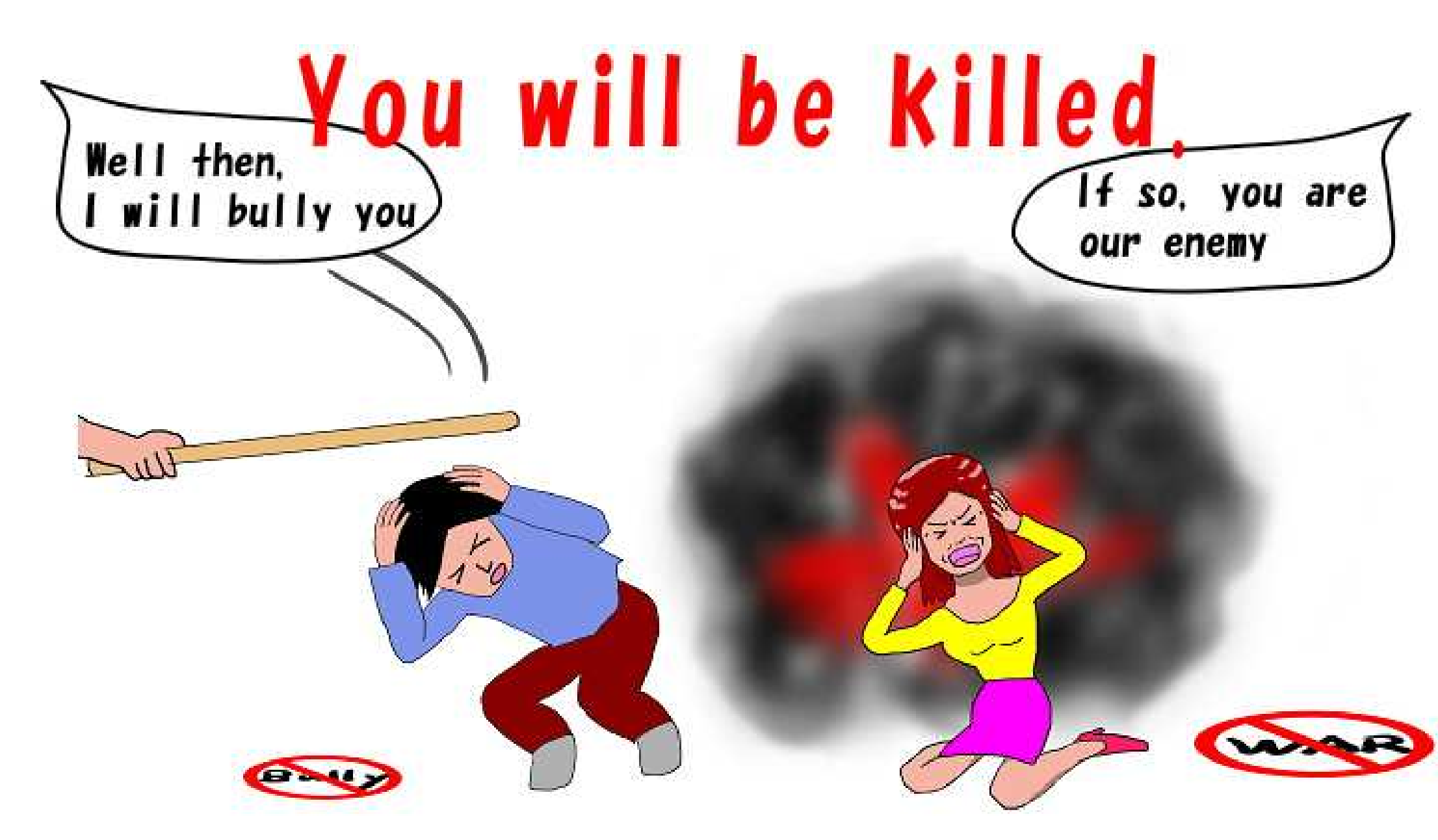
Therefore it is easy to support bullying or wars, but is very hard to stop them.