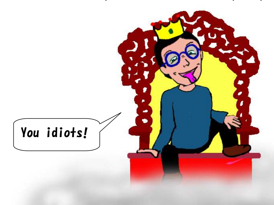
Huh? Do you want to know how it works?

No problem! There is a way to look down on everybody!