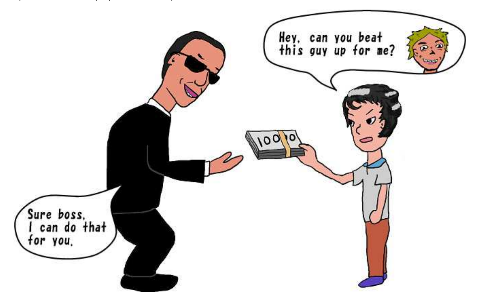
But I don't have enough money, and even if I do, I prefer not to use my own.