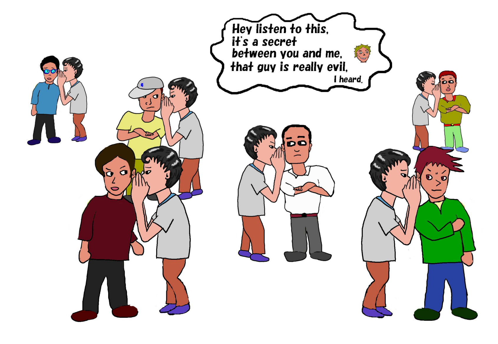
So I whispered to many people.